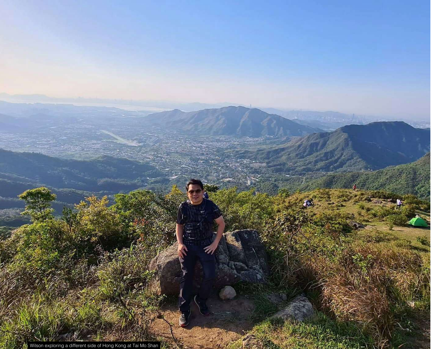
Wilson exploring a different side of Hong Kong at Tai Mo Shan