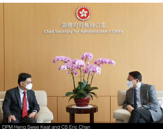
DPM Heng Swee Keat and CS Eric Chan

as soon as possible, to foster economic integration and push for high quality development together. These meetings helped to renew our friendship and convey our common goal of bringing collaboration between Singapore and Hong Kong to the next level. DPM Heng also had the opportunity to catch up with former Chief Executive Carrie Lam, an old friend of Singapore whom he last met three years ago.