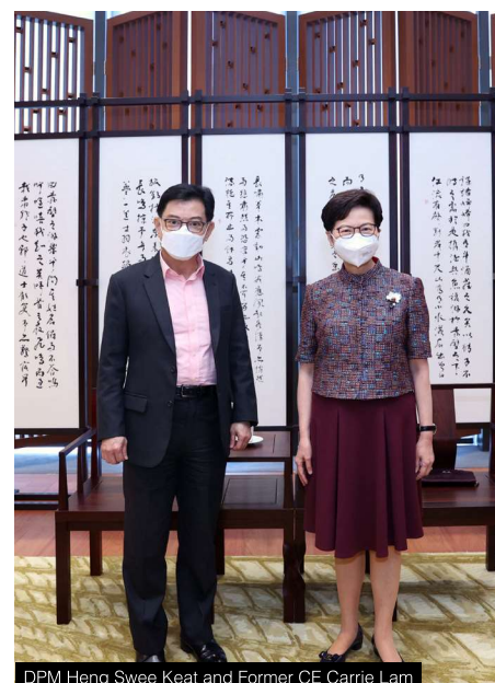
DPM Heng Swee Keat and Former CE Carrie Lam