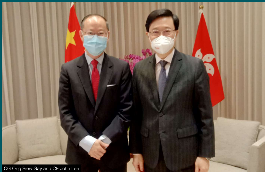
CG Ong Siew Gay and CE John Lee

Organised by SingCham HK, supported by Singapore Global Network, Consulate-General of Singapore in Hong Kong, Singapore Association Hong Kong, Little Red Dot and sponsors, Singapore Festival was held at Central Market from 12 to 13 November 2022. The event brought a taste of the Singapore experience to our community and friends in Hong Kong through food, live performances, arts and traditional games.