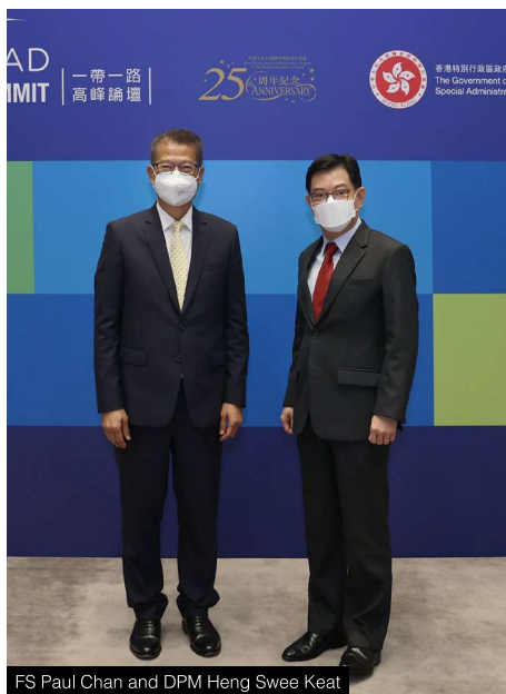
FS Paul Chan and DPM Heng Swee Keat