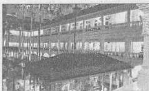
The brilliantly illuminated Raffles Hotel

Admission is free. The museum is open daily from 10am to 7pm.