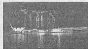
Marina Bay Sands and nearby waterfront buildings by day and night.

luxury shopping mall. Get there early to grab a good seat, since it's often packed before the show starts.