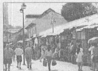
Sampling Chinatown's distinctive culture

India. There the cultures and traditions are represented by food, shops, architecture and people. You can join in festival celebrations at various seasons. Religion is important in all three quarters where there are many temples, churches and mosques, and admission is free. There's no better place than Singapore for visiting various religious shrines without paying a few. There's so much to discover.