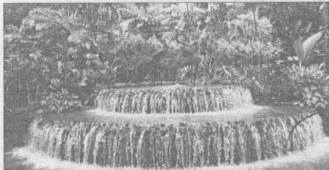
Singapore Botanical Gardens epitomize the Tropical Garden City.