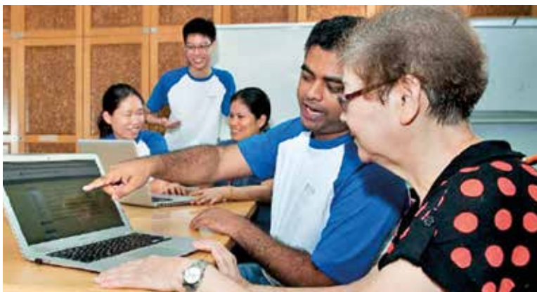
◀ Student volunteers work with voluntary welfare organisations to co-create IT-based solutions.

With the S$100 million National Youth Fund, the VYC will provide resources and support to volunteers. Youth and community organisations will help to train and mentor participants, while allowances will be given to those who wish to