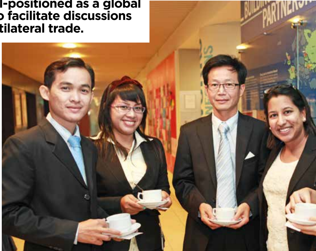
↑ Participants of the Singapore-US Third Country Training Programme joint training course on Investment and Trade Facilitation, held in August 2013

The Republic has a network of about 20 free trade agreements, and is constantly looking for opportunities to expand cooperation in trade with other countries. For instance, it is currently involved in negotiations for major regional trade agreements, such as the Trans Pacific Partnership and the Regional Comprehensive Economic Partnership. It is also