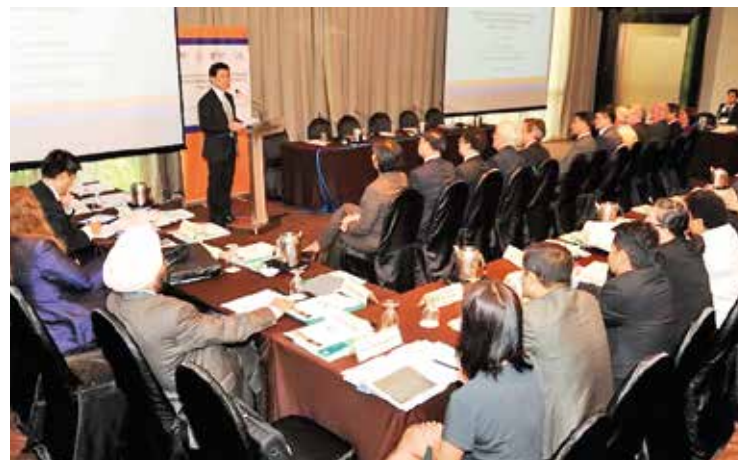
↑ Singapore's Senior Minister of State, Trade and Industry, and National Development, Mr Lee Yi Shyan, was the Guest-of-Honour and keynote speaker at the Policy Dialogue.

Third Country Training Programme, offering participants the chance to learn from the experiences and trade models of both Singapore and the United States.