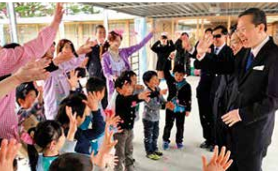
↑ A Year of Helping , pg10

Experience Singapore looks back at some instances of how the Republic extended a helping hand in 2013